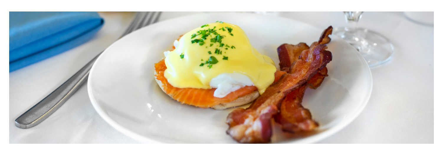
A 23 percent service charge (26 percent for outdoor events) and applicable local and state taxes will be applied to all food and beverage charges. Prices and menu descriptions are subject to change.