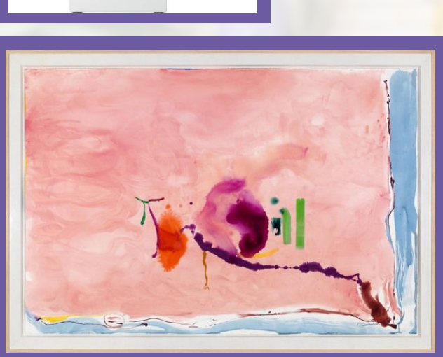
Third Course: Flirt by Helen Frankenthaler

roasted red & yellow beets, butternut squash, micro greens, black sesame, goat cheese spread