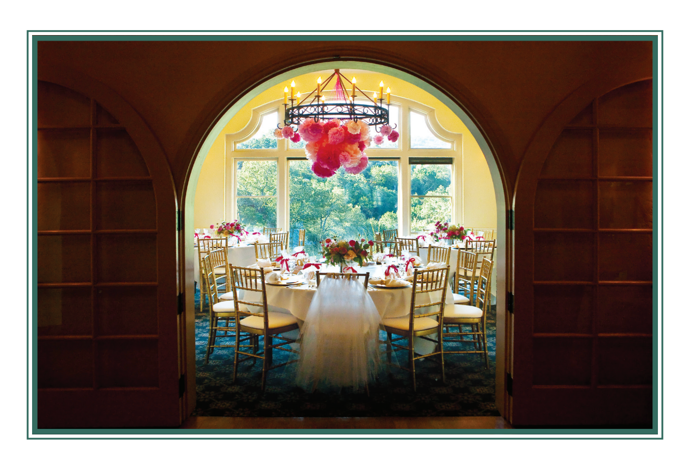
Member Wedding Packages